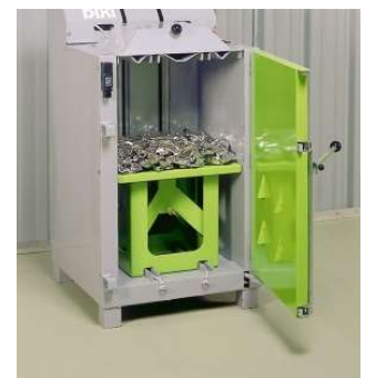
Adaptor to compact cans (Special equipment)