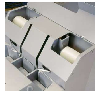
Easy accessible tying tapes