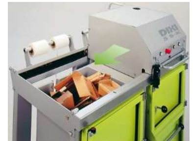
Additional press chamber (optional)